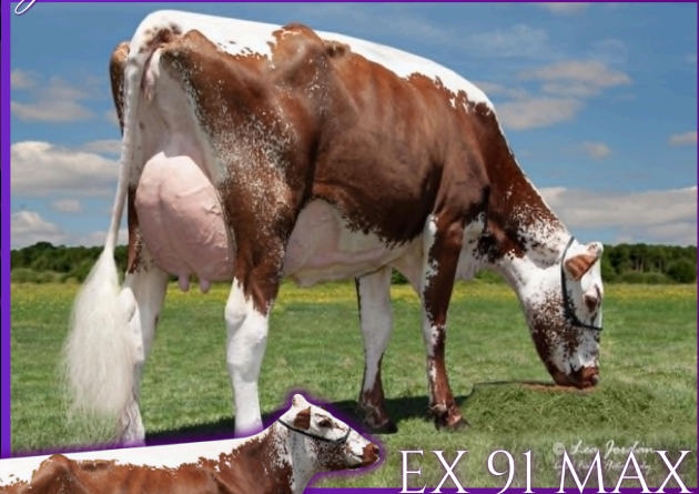
EX 91 MAX

Lush's embryos by DIABLO - AVAILABLE IN THE NATIONAL SALE