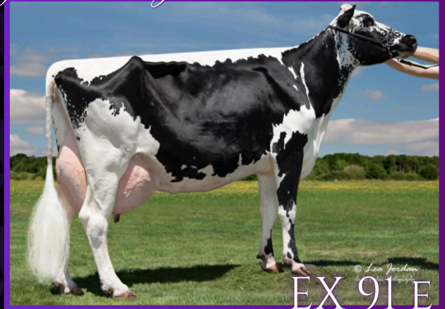
EX 91 E