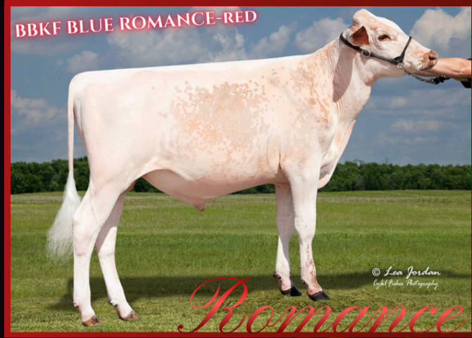
BBKF BLUE ROMANCE-RED

2023: SUPREME CHAMPION – GOSHEN FAIR 4TH SR. 2 YEAR OLD – MARYLAND STATE FAIR RED & WHITE SHOW 5TH SR. 2 YEAR OLD – PREMIER NATIONAL JR. RED & WHITE SHOW