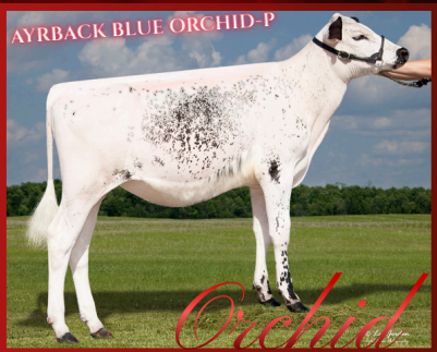
AYRBACK BLUE ORCHID-P

THE ONLY SON OUT OF AYRBACK WARRIOR REBEL-RED VG88, WHO HAD BIG SHOW SUCCESS HER ENTIRE CAREER, SUCH AS WINNING MULTIPLE JUNIOR CHAMPION TITLES AND SUPREME COW AT GOSHEN FAIR! COMPETING WITH SOME TOUGH RED AND WHITE COMPETITION AT THE ALL AMERICAN, BEING 12 OUT OF 18 WINTER CALVES IN 2021, AS WELL AS 5 OUT OF 7 AT PNJs AS A SENIOR 2-YEAR-OLD. SADLY, SHE LEFT HER LEGACY TOO SOON, BUT SHE BLESSED US WITH A BEAUTIFUL RED FALL CALF(BBKF BLUE RIBBON-RED) – FULL SISTER TO ROMANCE. COME CHECK OUT HIS FULL SISTER, BBKF BLUE RIBBON-RED , AND HIS PATERNAL SISTER AYRBACK BLUE ORCHID-P AT THE NATIONAL SHOW THIS YEAR! INQUIRIES ALWAYS WELCOME!